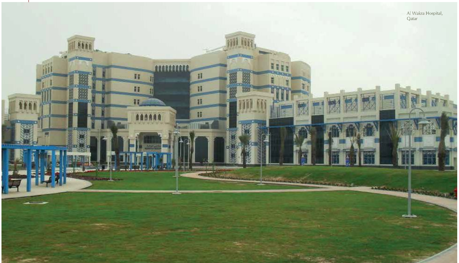
Al Wakra Hospital, Qatar